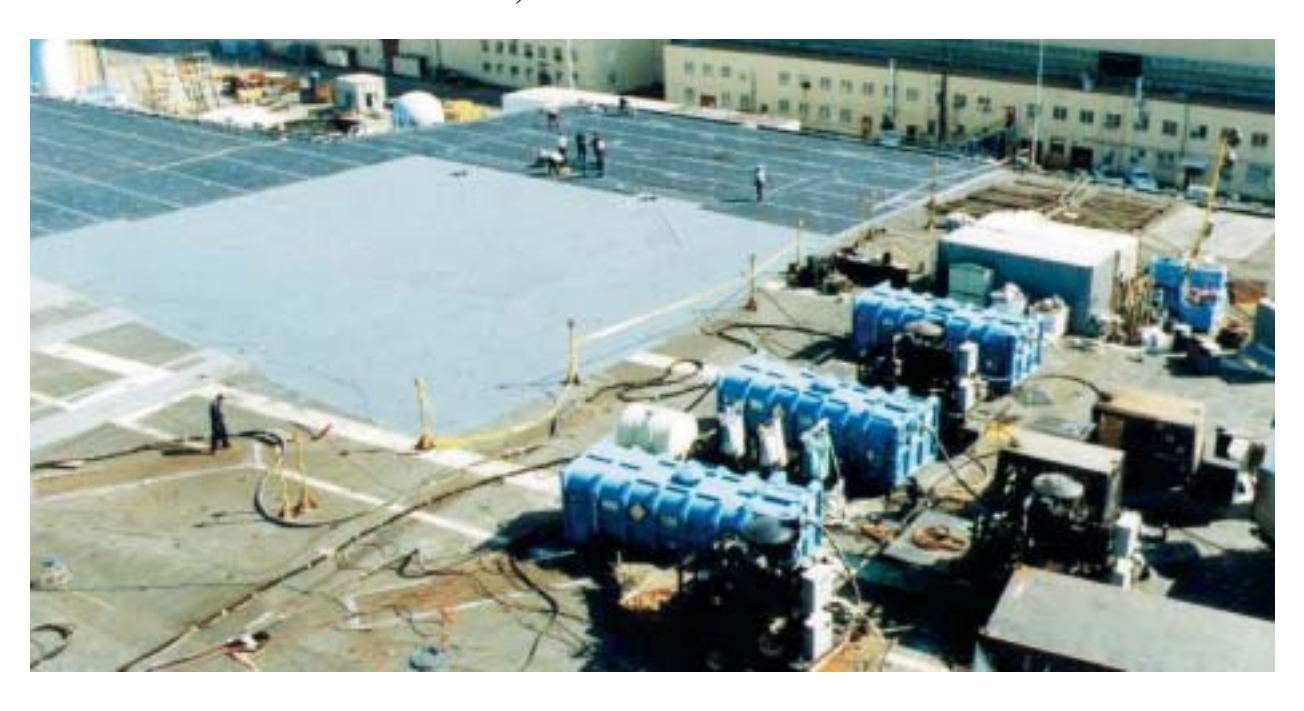
UHP Projects, Inc.'s equipment on the flight deck of CVN 73, the USS George Washington