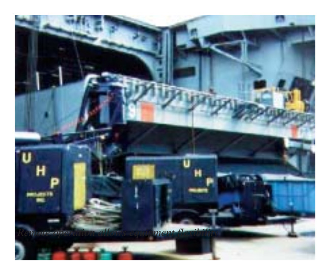
The following is an article that appeared in the Norfolk Naval Shipyard Newspaper "SERVICE TO THE FLEET"

Reprinted from the October 2, 1998 SERVICE TO THE FLEET newspaper.